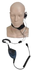
Intrinsically Safe Throat-vibrating Earpiece(IP67) ELN09-Ex* 1

* 1 These accessories are in certification