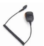
Intrinsically Safe Remote Speaker Microphone(IP67) SM18N4-Ex