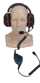
Intrinsically Safe Noise-cancelling Headset ECN20-Ex* 1